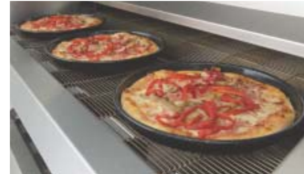
Pizzas, pies and pitta bread pass through during a baking time of from 2 to 10 minutes.

The TP is constructed with radiant heat, both top heat and bottom heat, for working temperatures of up to 400°C. This means that the pizza can be baked very quickly with a crispy surface and without drying out inside, so that all taste is retained.