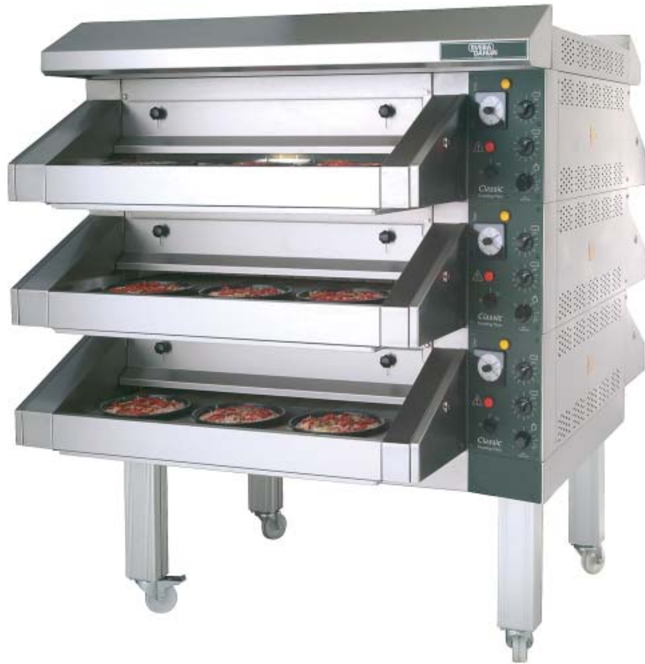
TP Travelling Pizza Oven, model TP-32