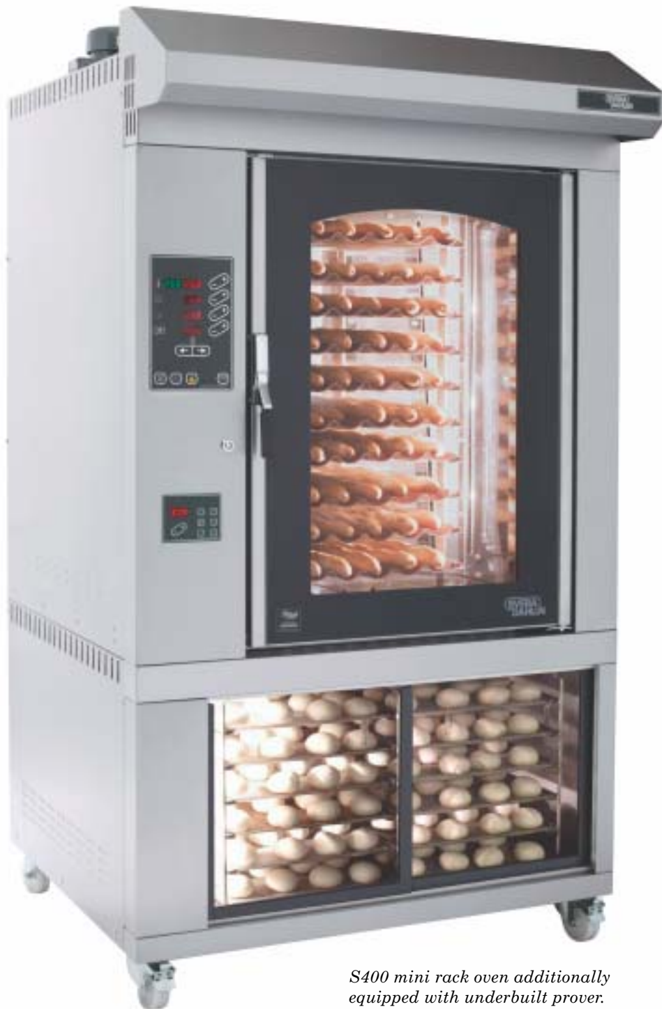
S400 mini rack oven additionally equipped with underbuilt prover.