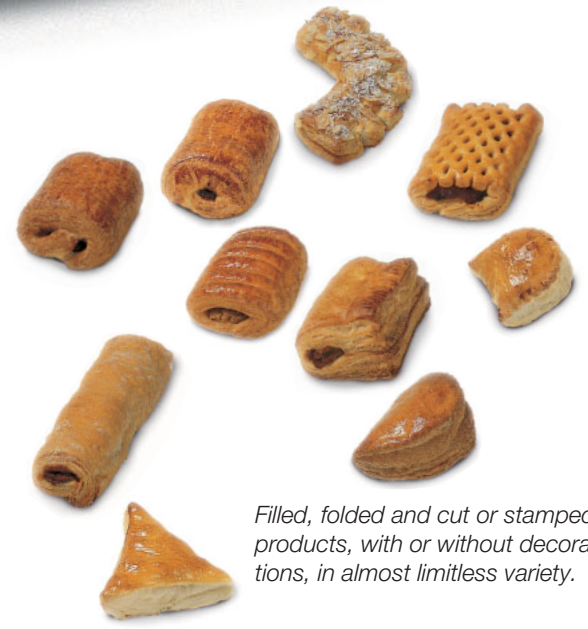
Filled, folded and cut or stamped products, with or without decorations, in almost limitless variety.

It can even be placed in front of the filling depositor. This way, a number of special products, such as cookies and Danish pastries can be rationally produced in a semi-automatic way.