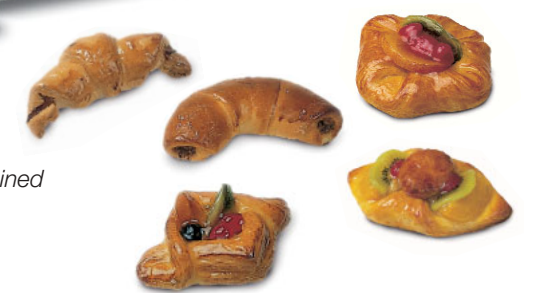
Automatic cutting and filling, combined with manual finishing – There is no limit to your creativity.